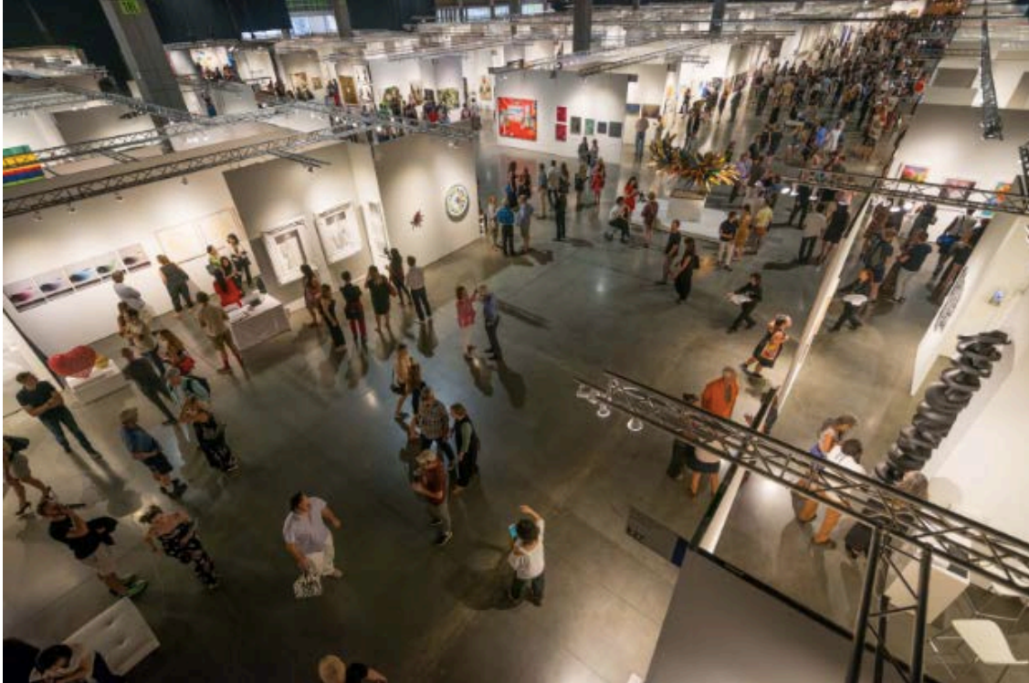
Seattle Art Fair 2017.

This year's Seattle Art Fair, presented by AIG, will take place August 2 - 5 2018 at the CenturyLink Field Event Center . The 2018 Seattle Art Fair boasts a diverse roster of local, national, and international galleries representing over 100 galleries from 36 cities from 10 countries, including 25 international galleries.